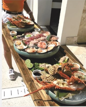
SEAFOOD & SASHIMI