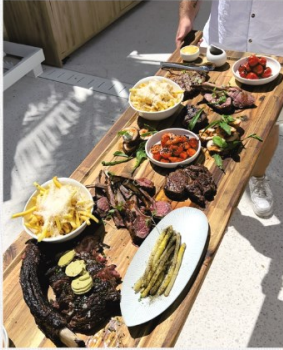
CHARGRILLED PREMIUM CUTS